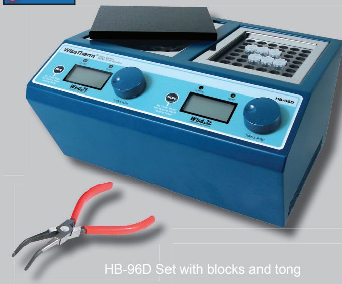
HB-96D Set with blocks and tong